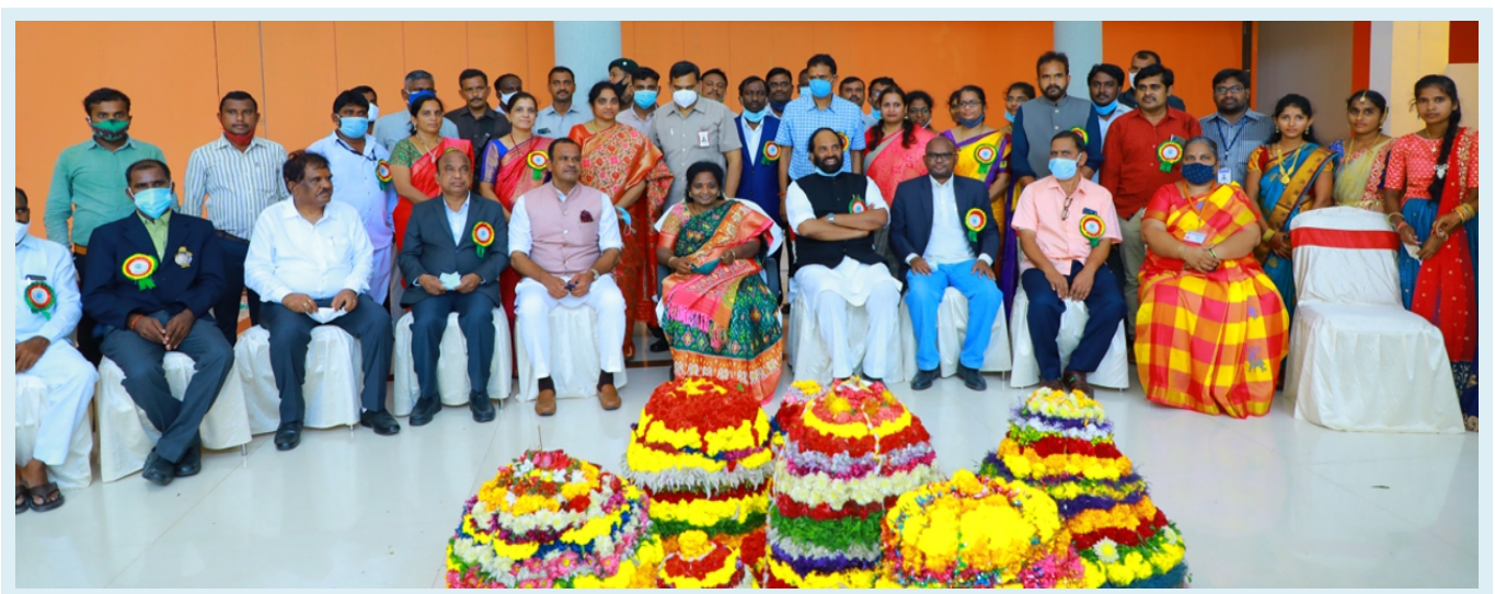
Her Excellency Governor Dr. Tamilisai Soundararajan Visit to MG University and Unveiled the Gandhi Statute and participated in Bathukamma Programme.

As part of the programme, Dr. Tamilisai Soundararajan released the pamphlet to create awareness on "Chancellor Connects Alumni" initiative to enlist the support of the alumni for the all-round development of the universities in the State.