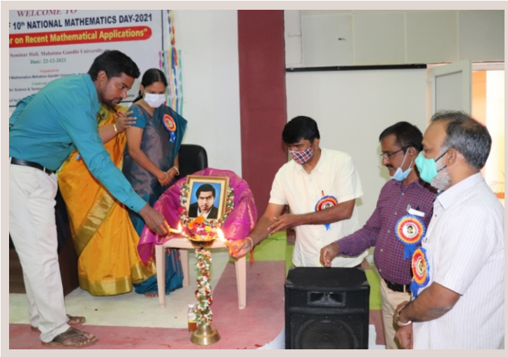
Mathematics Day Celebration at MGU