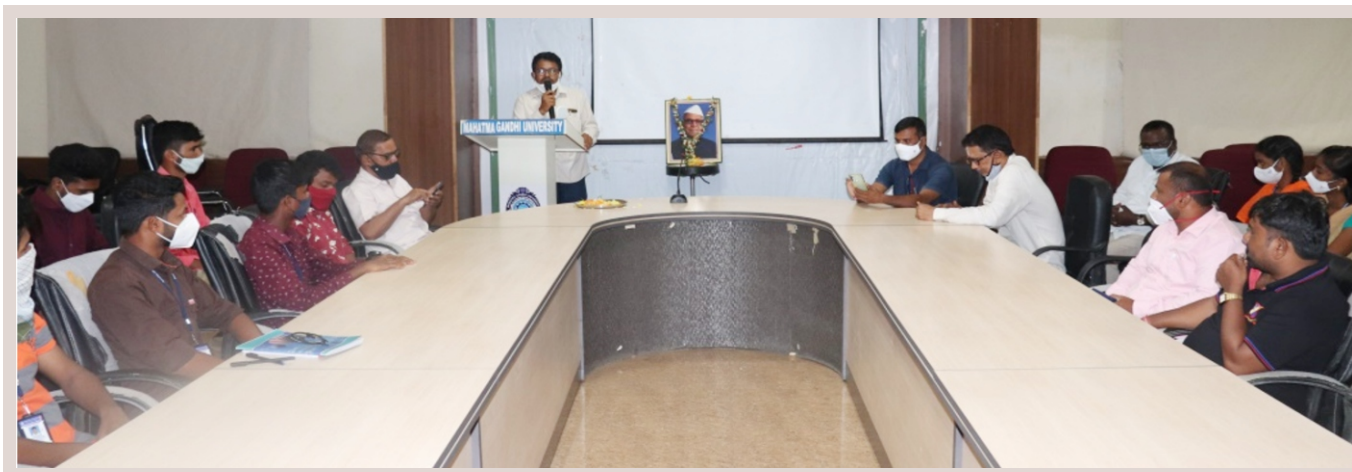
Birth anniversary celebrations of Kaloji at MGU